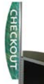
Entry sign 11"x60"