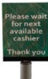
Sign frame 8-1/2"x11"

Attach messages or merchandise (or both) to any post in your queue.