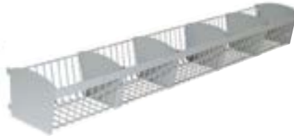
Wire basket with movable dividers 7"x48"x5"