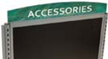
Header sign 7"x47-3/4"

Advertise promotions on impulse sales, make a visual splash, and ensure that every customer's first impression is a lasting one.