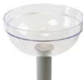
Clear plastic bowl 10"x4-3/8"