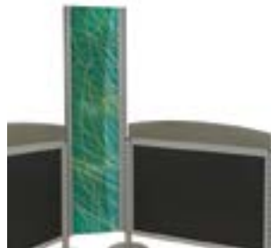
Corner sign 17"x60"