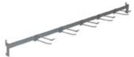
Peg bars with snap-on hooks 6"x48"