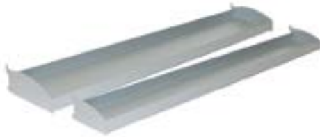
8" Shelf, 5" shelf 8"x48" and 5"x48"

Store a little or a lot with retail-ready Q+ merchandising accessories that can be configured in a variety of ways and work with all product loads to ensure that customers see your products.